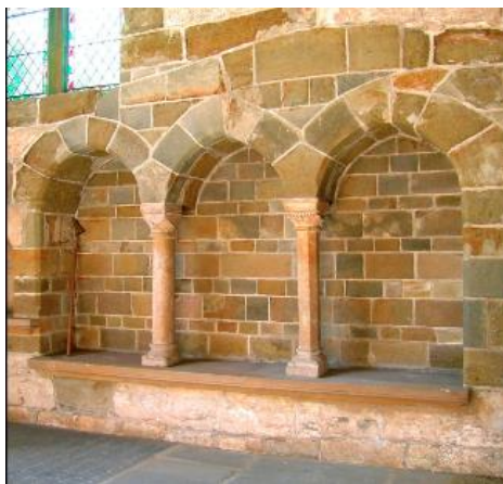
Church Parts Explained