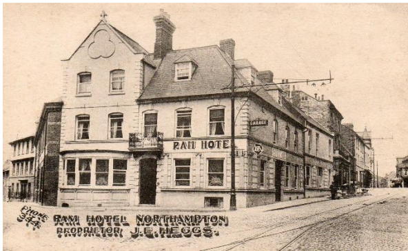
The Ram Hotel, Northampton