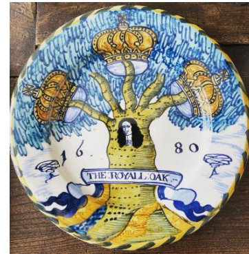
Oak Apple Day