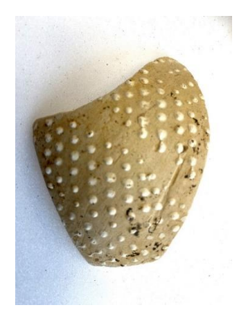
Eaten Alive by Eels