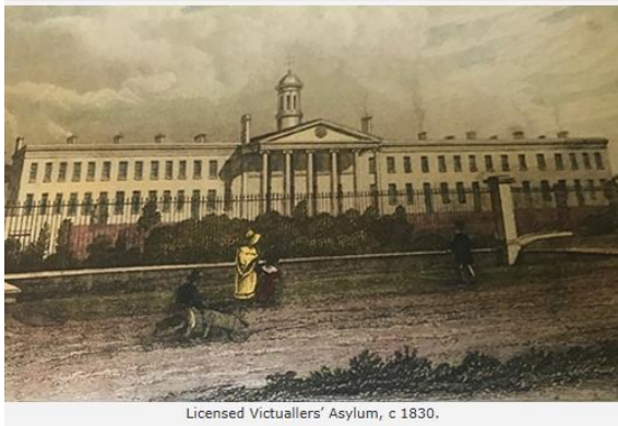
Licensed Victuallers' Asylum, c 1830.