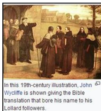
In this 19th-century illustration, John Wycliffe is shown giving the Bible translation that bore his name to his Lollard followers.