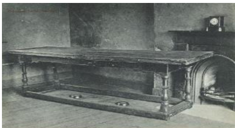
The Cromwell Table