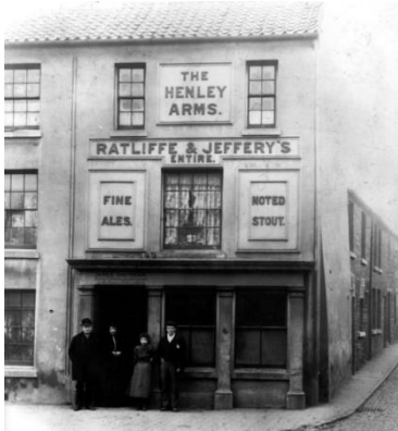
Henley Arms, 2 Gas Street